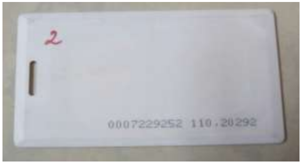
Figure 1: RFID Passive tag.

We are using Passive RFID tag with Low Frequency 125 KHz for demo purpose but for practical situation you can use UHF with active RFID Tag. RFID Tag is embedded with transmitter, receiver, chip and antenna