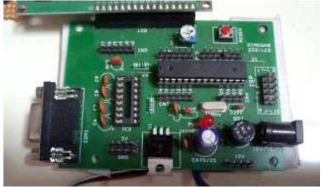
Figure5: Microcontroller board.

The Atmega328P-PU is an 8 bit low power microcontroller board with flash memory and EEPROM. It has 14 digital input/output pins (of which 6 can be used as PWM outputs), 6 analog inputs, a 16 MHz crystal oscillator, a USB connection, a power jack, an ICSP header, and a reset button. It contain all the feature to support microcontroller and power-up through USB 5V or external power supply (7V to 12V) DC adapter. Once we program the central computer mobile number microcontroller relay whatever tag RFID reader reads through GSM module in this way we save one computer cost.