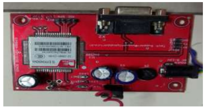
Figure4: GSM Module

In Our Project we use GSM(Global System for Mobile Communication) Module to transfer the data collected by RFID Reader to central computer for further processing and to find the exact location of the no show passenger. Since we use many RF Reader kit in the passage of the airport. The data collected by each RFID Reader is sent by SMS (Short Message Service) to the central computer and we analyze the SMS and split the data in to different field and save in the database table to find the no-show passenger and further action. In One word we can tell GSM module is used for remote wireless data collection& transfer process.