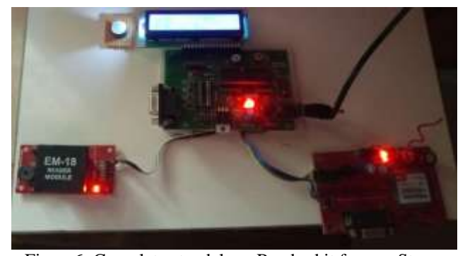
Figure6: Complete standalone Reader kit for one Stage