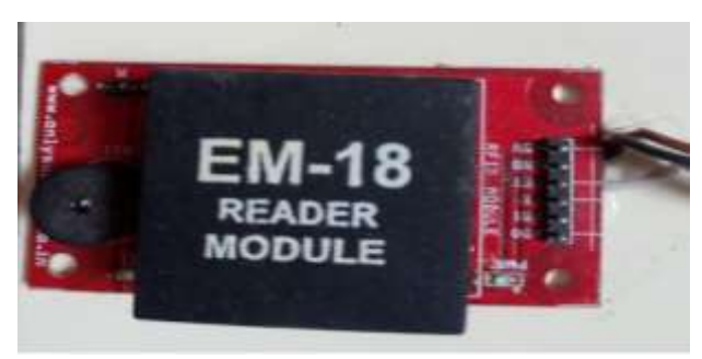
Figure2: RFID Reader EM-18

We used EM-18 RFID reader module. It is Low frequency RFID Reader and operates at 125 KHz. It contains on-chip antenna and work with 5V source voltage. It reads the RF signal from the tag and converts in to identity data.